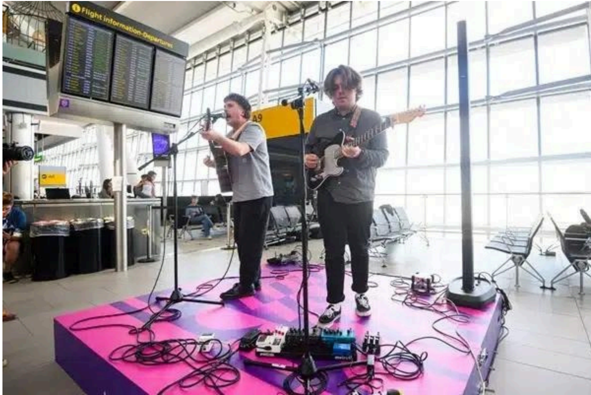
(China Bears Performance,)

Festival season is high at the moment and it's a godsend for anyone who is striving to get a foothold in the industry, especially with the execs passing through Heathrow, I think the Heathrow passengers are going to have a ball at the gigs. This is not just an entertainment project – it is about the atmosphere that should complement people's travelling experience.