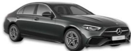
Mercedes E Class