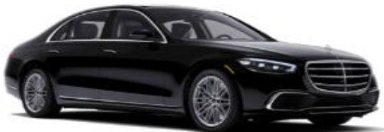
Mercedes S Class

The first impression matters, and A celebrity escort administration guarantees you a memorable one. Imagine this: A luxurious sedan or gleaming limousine arrives precisely on time. A neatly dressed chauffeur emerges, opens the entryway with an obliging thrive, and whisks you away in unrivalled solace. You show up, looking refreshed and composed, prepared to conquer the day or night ahead. It boosts self-confidence and sets the stage for a positive and stress-free experience.